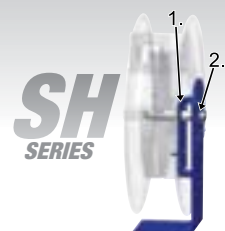
Double axle support on SH, MP & HP Series

SUPER HUB™ EQUIPPED MODELS: INCREASED REEL STRENGTH for more demanding applications with multiple support to the axle